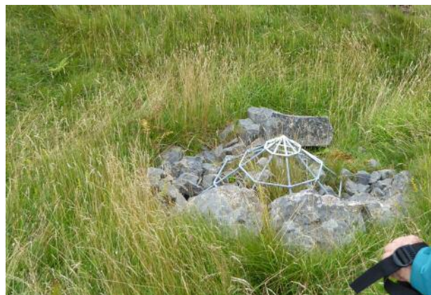
Fig. 2 Clywd cap.

The Halkyn estate covers 1800 acres, has 4000 mine shafts/deep mines, three active quarries, disused limekilns, Moel y Gyr Iron