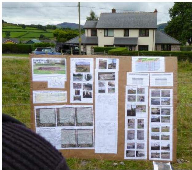
Fig. 1 Poster showing history of the collapse and remediation work.