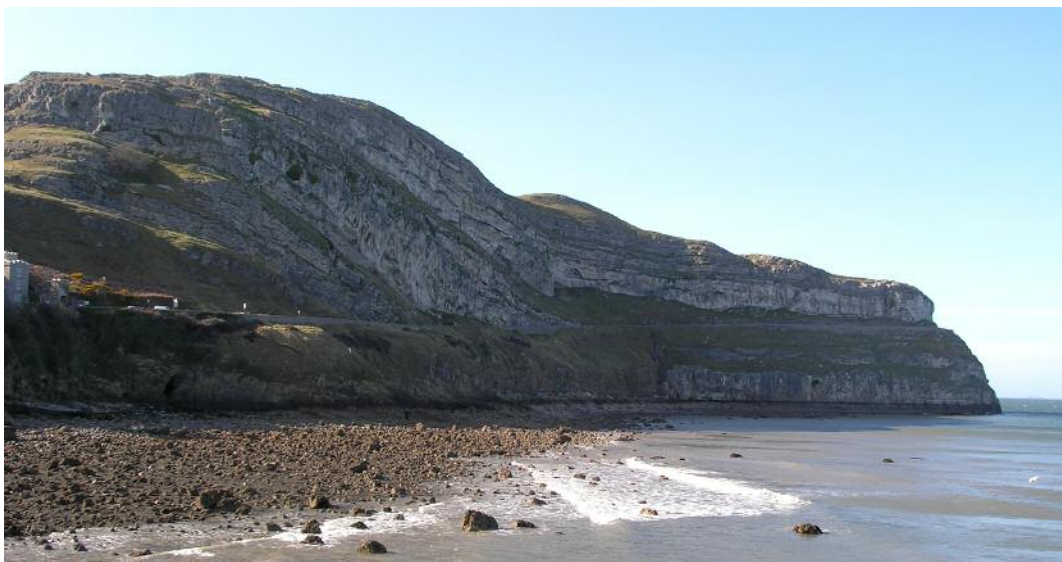
Cyclic stacking of Lower Carboniferous Limestone, Great Orme, Llandudno

This one day fieldtrip will examine the spectacular outcrops of Lower Carboniferous limestone that are exposed on the Great Orme, Llandudno. The sediments were deposited on a shallow water carbonate platform that extended from the Llandudno area southwards to a palaeo-landmass (St Georges Land). The sediments show a well developed cyclicity, forming packages that are tens of metres thick and capped by palaeo-soil horizons, providing evidence that the platform periodically became emergent. The field trip will examine these cycles and also spend time (tide-permitting) discussing the importance of faults to dolomitisation and mineralisation of the succession. Walking will mostly be on well-made paths.