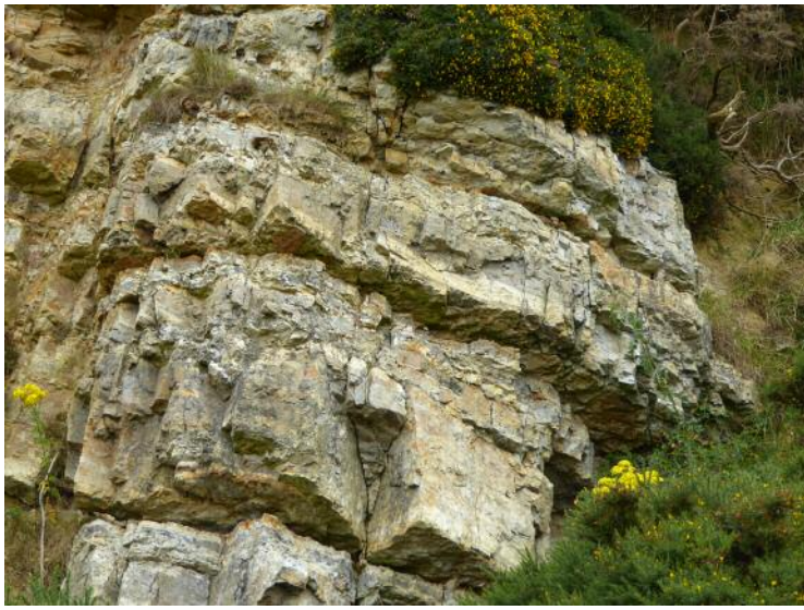
Fig. 7 Banded chert.

for the volume of chert produced, but it is likely to be of biological origin. We also saw what Tony considers is a Neptunian dyke (where a crack in the sea floor is in-filled with sediment). He postulated that there is a tendency for rimmed carbonate platforms to lose their edges resulting in debris flows. This debris can fill cracks in the sea floor. Certainly there was an area where the rock was definitely mashed up (although now heavily vegetated this could just about be seen).