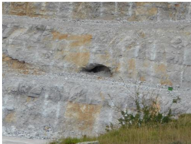
Fig. 3 Tunnel in quarry face.

To remediate the collapse large plugs of PFA/cement (9:1) were put in the hole; 687 tons of rock and 227 tons of grout were used! Locally sourced topsoil was used to cover this then the area was fenced. It is hoped that the fence will be removed shortly.