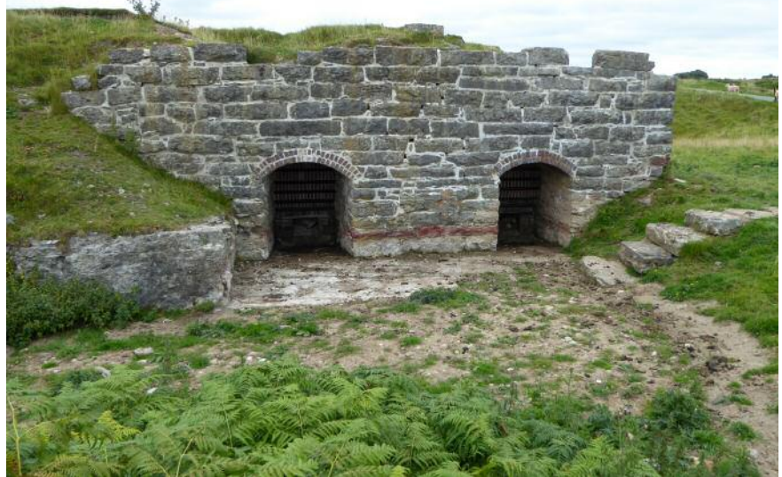
Fig. 5. The Lime Kilns.

It is set in the Brigantian age Cefn Mawr Limestone formation that is generally dark carbonates. It is easy to tell them apart from the Loggerheads formation, as the latter are much paler. As with everything, just because a limestone was light coloured, it did not mean that it was the Loggerheads formation as some of the Cefn Mawr formation limestones are also