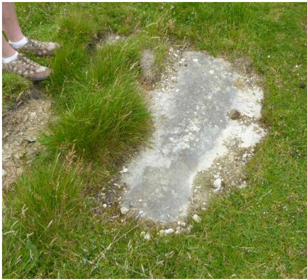
Fig. 4 The Knocking Stone.

the Dee Estuary, Blackpool Tower (just), Liverpool Anglican Cathedral, the Clywdians and Snowdonia. After passing by the Knocking Stone (Fig. 4) where the ore was broken up, looking at rare Stemless Thistles and the lead ore washing areas, we visited the lime kilns where we found crinoid fossils and the occasional productid. The limekilns (Fig. 5) have been restored with small holes left in the brickwork for bats.