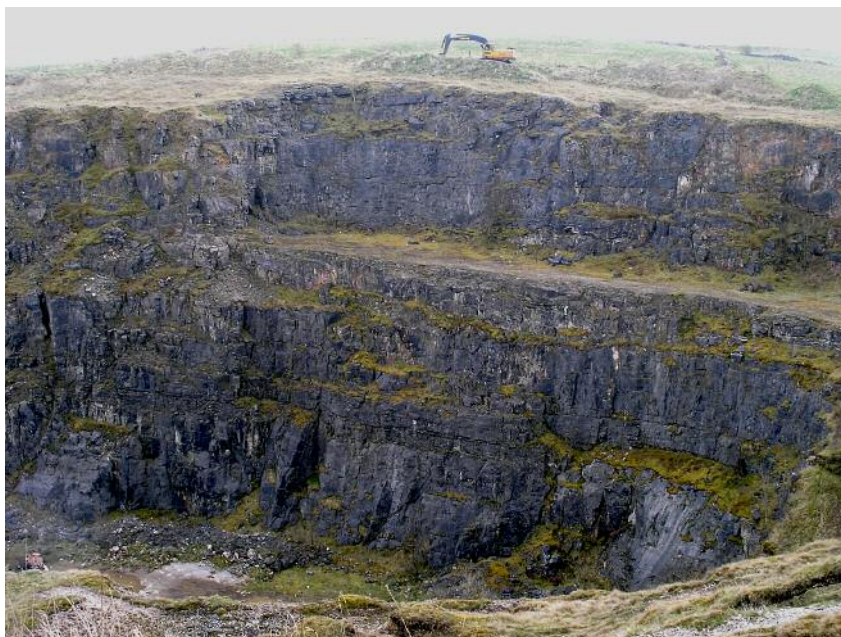
Lower Carboniferous limestone on the northern margin of the Derbyshire Platform, Pin Dale, near Castleton.

This excursion will examine the sedimentology of the northern margin of the Derbyshire Platform, focusing on the Castleton area. In the Lower Carboniferous this region was located on the margin of a steeply dipping carbonate platform. Present day exposure within disused quarries and along public footpaths allows a cross section of facies from the platform top, across the platform margin and into the basin, to be examined. The trip will involve walking on rough, but well-marked, paths between Castleton, Cave Dale and Pin Dale.